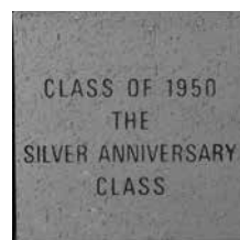
8 x 8 paver Up to four lines of text: $150

Visit: Leave a Legacy website at sedaliasdf.org/leave-a-legacy/ to download a Leave a Legacy order form.