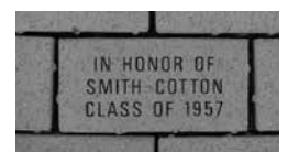
4 x 8 paver Up to three lines of text: $75