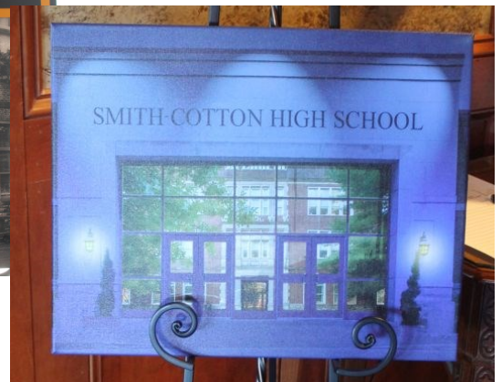
Photos of original one-of-a-kind artwork in the SSDF silent auction.